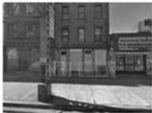
1148 Myrtle Ave Brooklyn, NY 11221